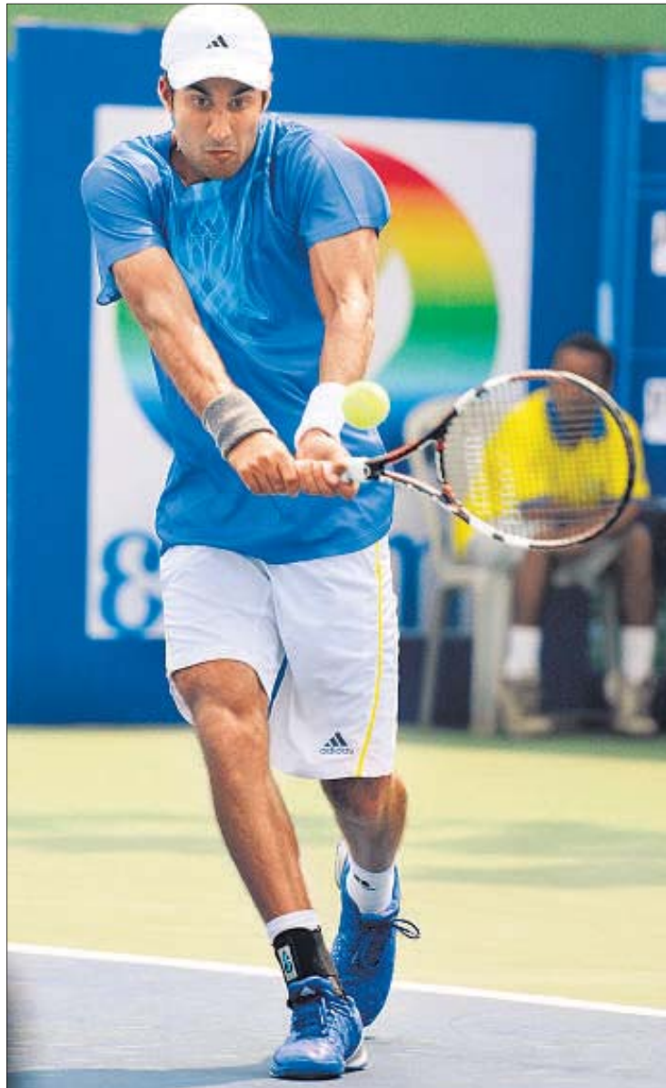
The demons of his loss in the fifth rubber against Serbia last year did not come back to haunt him on Sunday, when Yuki Bhambri won the decider to send India to the Davis Cup World Group playoffs.

CHRISTCHURCH: India claimed both reverse singles to snatch a dramatic 3-2 victory over New Zealand in their Davis Cup tie on Sunday. Victory in the Asia-Oceania second round tie qualifies India for the World Group playoffs in September.