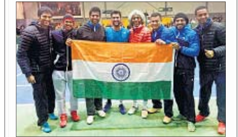
Somdev Devvarman (second from left), whose win levelled the tie before Yuki Bhambri (fourth from left) won for India, credited Rohan Bopanna (third from left) and captain Anand Amritraj (fourth from right) with boosting the team's morale ahead of the final day.

Trailing 1-2, India made a phenomenal comeback against New Zealand to win 3-2 and qualify for the World Group playoffs on Sunday. Here's a look at the previous five instances when India fought back from the brink of defeat in Davis Cup: